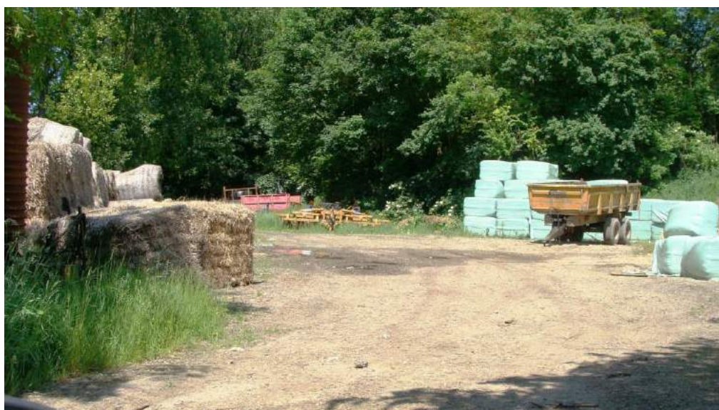
Picture 345. View of open agricultural storage area from public domain. It is recognised this area is very much part of an active working farm but any improvements to reduce its visual impact would be beneficial and appreciated.

5.601. Elements out of character with the Conservation Area. The area forming the eastern extremity of the conservation area is a large open storage area containing agricultural machinery and equipment, some obsolete. The site is untidy and can be viewed from the road and public realm that forms its southern boundary. It is the former site of the railway station. It is accepted the area is part of a working farm but the fieldworker considers that minor improvements such as doubling up additional frontage planting and removal of obsolete machinery and a general tidy up would be beneficial. Elsewhere the River Rib forms an appropriate eastern boundary and on balance it is considered this area can be removed from the conservation area.