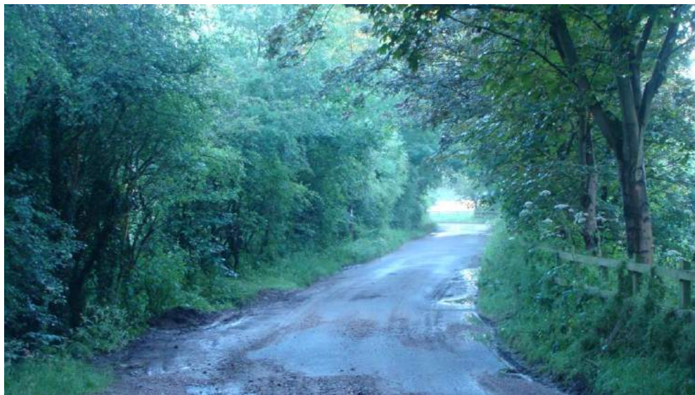
Picture 2930. Linear strip of unused land, heavily treed and visually important as a village approach.

5.501. Linear strip that is unused and overgrown east of Westmill Bury Farm and on opposite side of road to the Football Ground. Its small scale and roadside hedgerow and trees within the site are important components in this location and on this approach to the village.