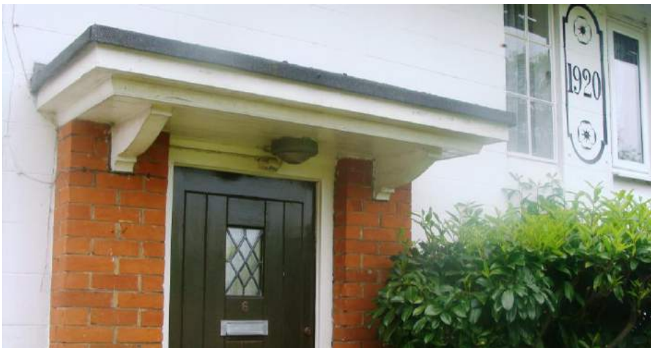
Picture 101. Unusual early 20th century council properties with original plaque and canopy detailing. Mostly original detail worthy of retention and protection.

5.267. Nos. 1-6 The Terrace. Three pairs of single storey dwellings dating from 1920. Of blockwork and brick construction with pyramidal tiled roofs and chimneys. Original canopies. No. 6 retains original Crittall metal windows but others are replacements. Despite this the grouping retains much of its original unusual character. An Article 4 Direction to provide protection for selected features may be appropriate subject to further consideration and notification.