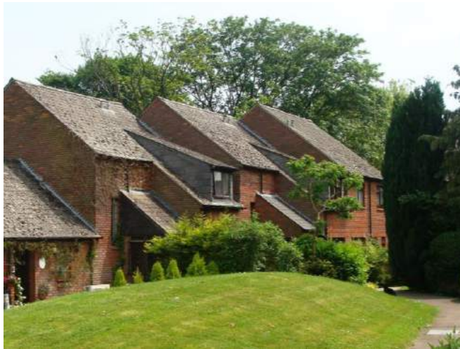
Picture 389. The Rookery- a council development dating from the later part of the 20th century is of a pleasant and cohesive design which, on balance should remain within the conservation area.

5.6870. Explanation concerning retaining The Rookery and environs within the conservation area. Whilst The Rookery is a later 20th century development it is of a pleasant and cohesive design that has remained largely unaltered. The trees to the immediate north are important and worthy of retention as is a small pasture land adjacent and to the west. On balance and for these reasons it is considered appropriate for The Rookery and environs to remain within the conservation area.