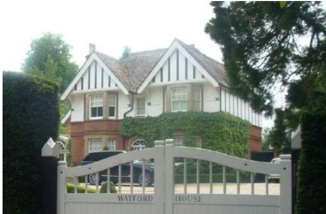
Picture 142. Watford House. Large detached property dating from the early 20th century, typical of its type and period.

and chimneys. An Article 4 Direction to provide protection for selected features may be appropriate subject to further consideration and notification.