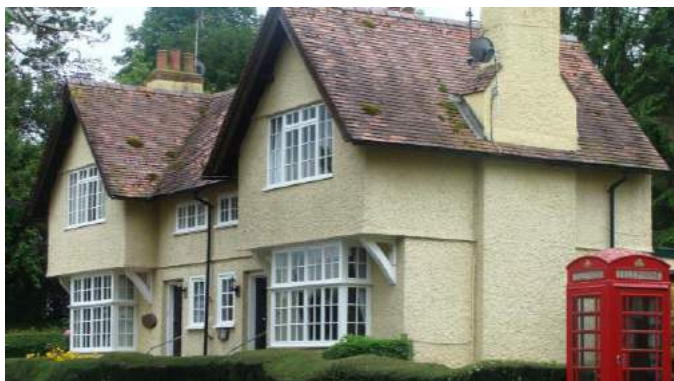
Picture 123. School Cottages - a fine pair prominent in the street scene with features of architectural interest most worthy of retention and additional protection.

5.2930. School Cottages. Dating from the late 19th/early 20th century. Prominent in the street scene. Of rough render with tiled roof and two large chimneys. Boxed windows to ground floor; upper floor protrudes. Some simple decorative wooden detailing; sympathetic window detailing common to frontages of both properties. An Article 4 Direction to provide protection for selected features may be appropriate subject to further consideration and notification.