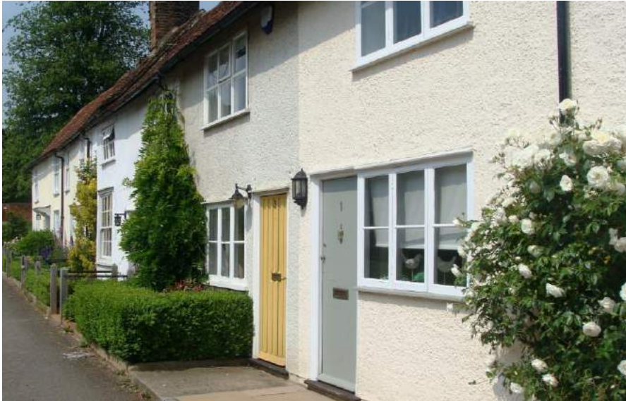
Picture 6. Pilgrims Row - a picturesque group of listed cottages in the centre of the village; quintessentially English is character.

5.13. Pilgrims Close Nos. 1-4 - Grade II. 4 almshouses. 18/19th century restored 1929 for Greg family in memory of T. T. Greg of Coles. Timber frame roughcast with steep old red tile roofs. 2 pairs of one and a half storeys houses adjoining Pilgrims House. Moulded plank doors in broad frames with small hoods on brackets. Small-paned 2-light casements. Low iron railing in front. Oval stone plaque in middle inscribed 'Dedicated in memory of T T G to Westmill by M G'. '1929' on separate tablet.