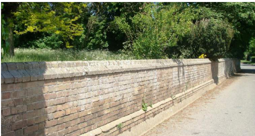
Picture 1 89 89 . Wall to front of St Mary's churchyard prominent and important in the street scene.

5.3 45 56 . Wall to front and to east side of St Mary's churchyard. Of brick construction with distinctive capping detailing. Prominent and important in the street scene. Relatively minor repair works needed to selected sections.