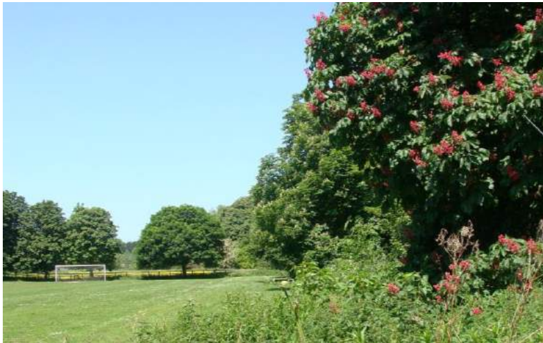
Picture 267. The football field. Its relationship with the River Rib and its fine mature boundary trees represents a small scale open space of quality important to the visual qualities of the conservation area.

5.445. Small scale pasture land north of the High Street and east of St Mary's church. This pasture land is most important in the context of the setting of the conservation area. The row of mature lime trees on its northern boundary are visually prominent and form part of the setting of the church and distant views of its spire. The land is distinct from the open countryside to its north.