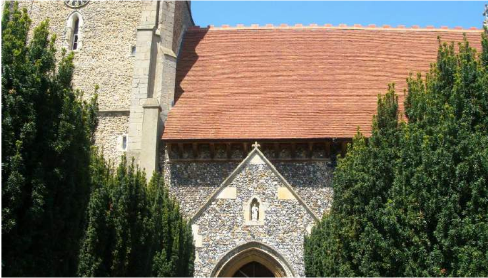
Picture 3. St Mary's church, a grade II* building with its recently restored roof.

5.9. Tomb in St Mary's churchyard - Grade II. Tomb chest. 18th century. Inscription worn (possibly to William Prisimer). Limestone with grey stone top slab. A rectangular tomb chest. Raised curb and moulded splayed base. Recessed gadrooned baluster corners. Rectangular stone panels on each face with raised and fielded panel. Moulded edge to overhanging top slab with primary inscription. This structure is included on the Council's Heritage at Risk Register and is thus potentially eligible for grant assistance.