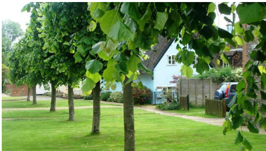
Picture 3 42 . The Lime tree row on village green south side of High Street is visually most important and would appear to replace similar planting identified on the late 19th century mapping.

5.5 67 . Throughout the conservation area trees play a very important role in adding quality to the environment generally and enhancing the historic built form. In this respect rows and an avenue of lime trees are particularly important. The presence of trees was an important component showing up on late 19th century mapping including the row in the High Street in the illustration below.