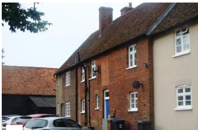
Picture 134. Residential accommodation at Westmill Bury Farm of brick construction with steeply sloping roof of historical and architectural merit worthy of retention.

5.301. Residential accommodation at Westmill Bury Farm. Late 19th century of brick and render with steeply sloping tiled roof with chimneys. Modern window detailing detracts. Nevertheless worthy of retention and additional protection. An Article 4 Direction to provide protection for selected features may be appropriate subject to further consideration and notification.