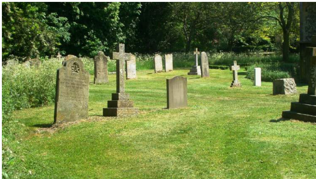
Picture 289. Well kept St Mary's churchyard with interesting range of tombs of various dates.

5.456. St. Mary's churchyard. Well kept with a variety of tombstones, two individually listed, at risk and previously referred to. Contains range of traditional churchyard trees including an Irish yew avenue approach. Contained by wall to front.