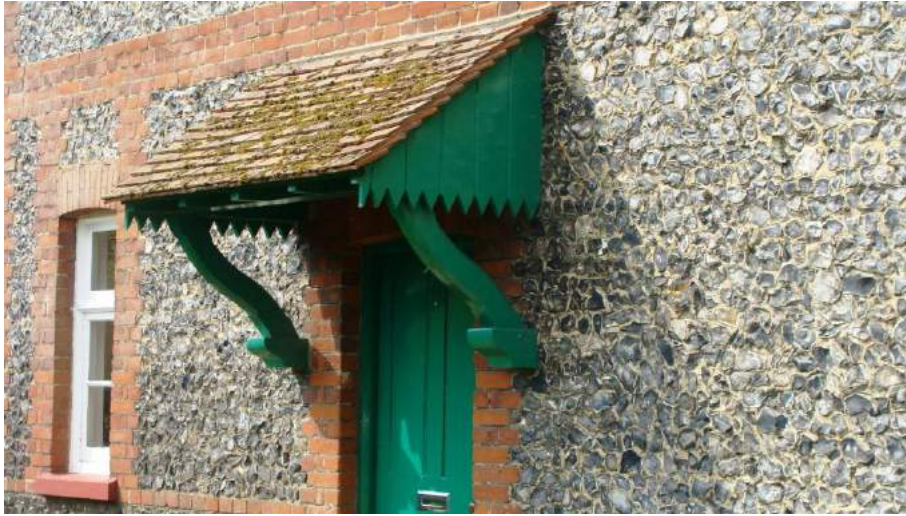
Pictures 145-167. Flint Cottages. Particularly fine flint and brick cottages probably dating from the early 20th century, unspoilt with many good quality features.

5.323. Nos. 1-2 Hope Cottages. Terrace of two prominent in the local street scene and dating from the early 20th century. Rough render with steeply sloping tiled roof and 3 No. prominent chimneys. Common early/sympathetic window detailing; central plaque inscribed TTG 1911. An Article 4 Direction to provide protection for selected features may be appropriate subject to further consideration and notification.