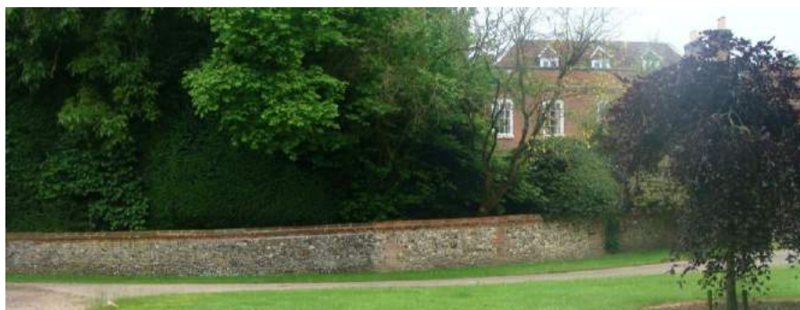
Picture 245. Brick and flint wall recently repaired, important to the setting of Westmill Bury.

5.3940. Brick and flint wall to front of Westmill Bury. Height varies. Owner advises recently repaired.