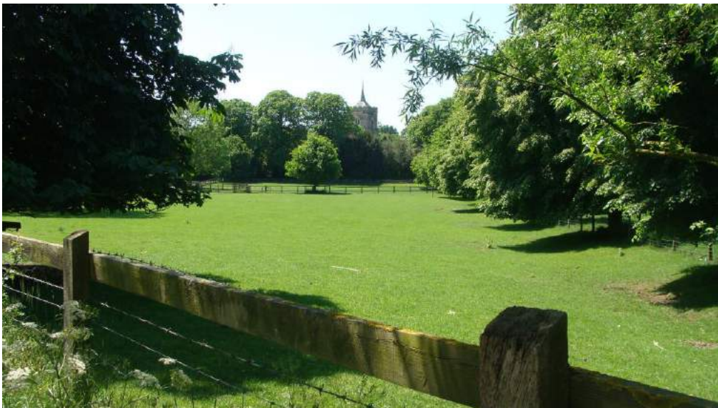
Picture 278. High quality pasture land a key small scale landscape feature to this part of the conservation area which provides a long distance view of the grade li* listed church.

5.445. Small scale pasture land north of the High Street and east of St Mary's church. This pasture land is most important in the context of the setting of the conservation area. The row of mature lime trees on its northern boundary are visually prominent and form part of the setting of the church and distant views of its spire. The land is distinct from the open countryside to its north.