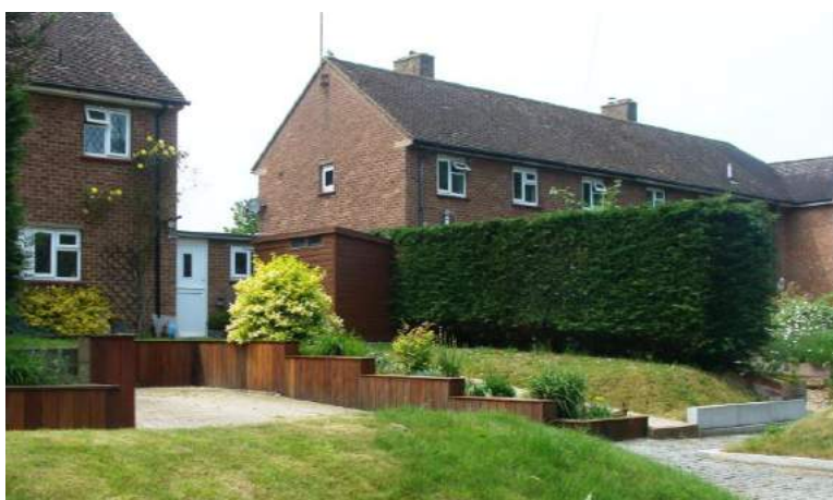
Picture 378. Nos. 1-4 Wilstone are proposed to be excluded from the conservation area.

5.678. Also exclude Wilstone, east side of Aspenden road. Mid later 20th century terrace housing of no architectural or historic interest with variety of uncoordinated frontage boundary treatments. However retain mature tree to frontage as this fine specimen (along with trees opposite) is important to this entrance point to the village.