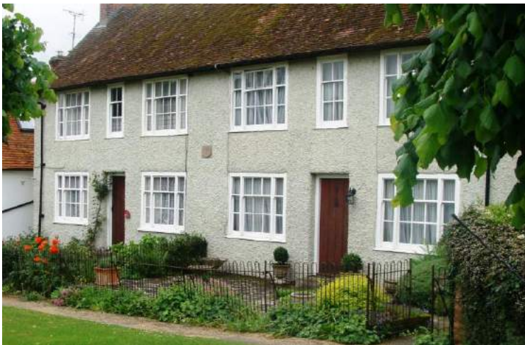
Picture 178. Hope Cottages - a prominent group with attractive detailing dating from the early 20th century most worthy of retention and additional protection.

5.323. Nos. 1-2 Hope Cottages. Terrace of two prominent in the local street scene and dating from the early 20th century. Rough render with steeply sloping tiled roof and 3 No. prominent chimneys. Common early/sympathetic window detailing; central plaque inscribed TTG 1911. An Article 4 Direction to provide protection for selected features may be appropriate subject to further consideration and notification.