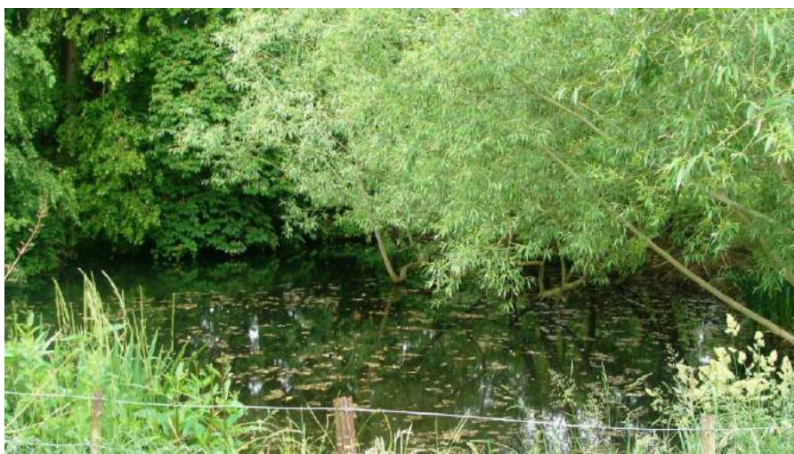
Picture 301. Pond and open space adds to the spatial quality and diversity of the conservation area in this location.

5.512. Small pasture and pond to west of approach access to Westmill Bury. This open space contributes to the spatial quality and diversity of the conservation area in this key location in proximity to a number of high quality listed buildings.