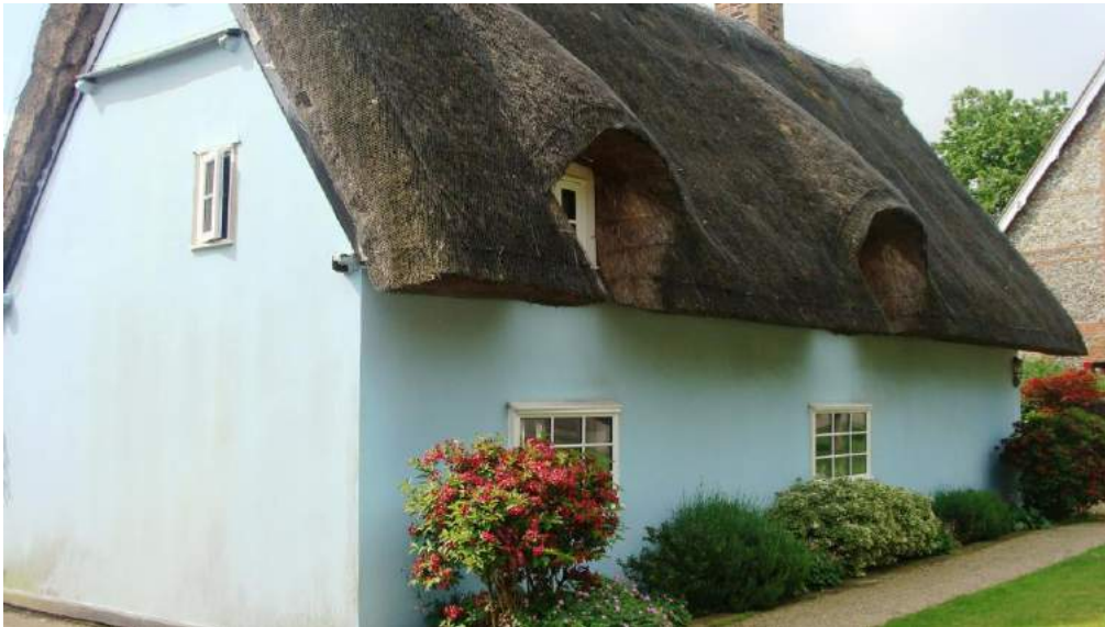
Picture 8 Woolpack Croft - a delightful thatched property listed grade II with typical eyebrow dormers.

5.19. Church House – Grade II. 16 th century south wing, early 17 th century front block with with rest later . Timber frame roughcast with steep old red tile roofs. Bellcast and plastered soffit to front eaves. Doric doorcase with fluted pilasters and triangular pediment with triglyph frieze.