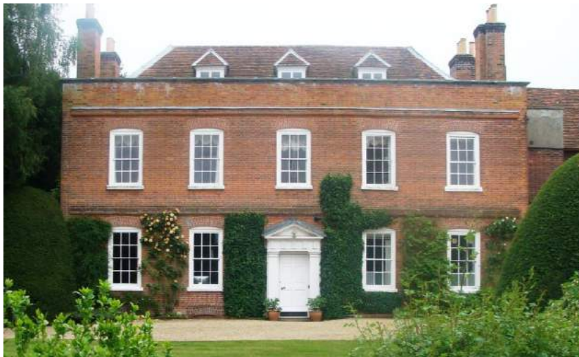
Picture 5. Westmill Bury a fine Grade II* listed house dating from the early 18th century.

5.11. Westmill Bury - Grade II*. Early 18th century. Red brick with old red tile roof. Double-pile plan main block of 2 storeys, cellar and attics, 5 windows wide, facing north and south. Symmetrical north and south fronts each with central doorway and slightly recessed box sash windows. North front has a pilastered Tuscan doorcase with full entablature and triangular pediment. South front to garden has a fanlight and a Doric doorcase with fluted pilasters.