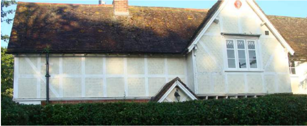
Picture 910. Gaylors Cottage - a late 19th/early 20th century house considered to be worthy of retention and additional protection. Prominent tiled roof adds quality to the conservation area in this location.

5.267. Nos. 1-6 The Terrace. Three pairs of single storey dwellings dating from 1920. Of blockwork and brick construction with pyramidal tiled roofs and chimneys. Original canopies. No. 6 retains original Crittall metal windows but others are replacements. Despite this the grouping retains much of its original unusual character. An Article 4 Direction to provide protection for selected features may be appropriate subject to further consideration and notification.