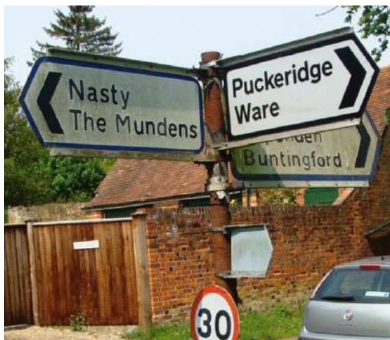
Picture 356. Directional sign post needing repainting.