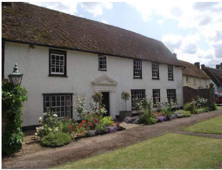
Picture 9. Church House dating from the 16 th century, listed grade II.

5.19. Church House – Grade II. 16 th century south wing, early 17 th century front block with with rest later . Timber frame roughcast with steep old red tile roofs. Bellcast and plastered soffit to front eaves. Doric doorcase with fluted pilasters and triangular pediment with triglyph frieze.