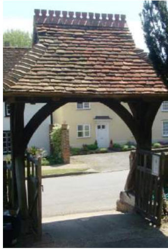
Picture 4920 . Recently repaired lych gate to St Mary's church.

5.367. Range of tombstones in St Mary's churchyard. Of various types and ages. Some in need of repair. Two wooden structures noticed.