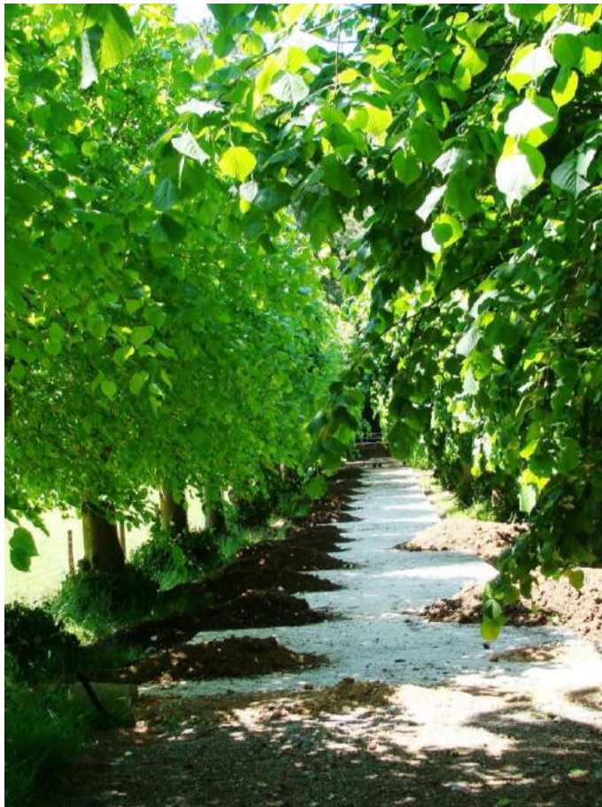
Picture 2 56 . Fine avenue of lime trees providing an access point to Westmill Bury. The avenue also separates two small scale open spaces important to the setting of the conservation area.

5.4 23 . Small scale pasture with sheep grazing, south of road and to east of Westmill Bury. A small scale and enclosed pasture which together with adjacent lime tree avenue represents a high quality open space forming an important part of, and setting to, the conservation area.