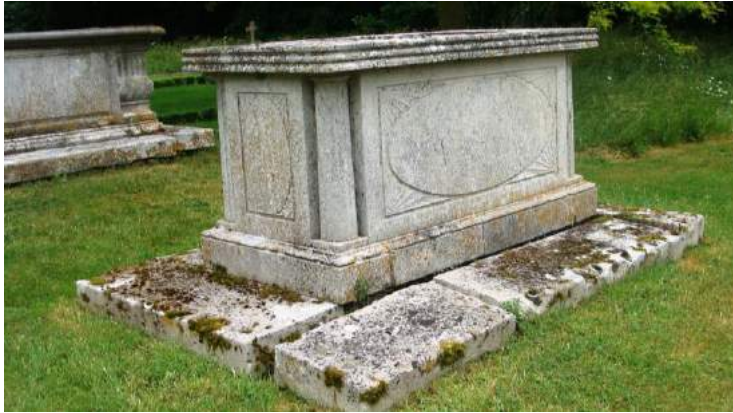
Picture 4. Listed chest tomb within St Mary's churchyard, one of two in need of repair and restoration and both, without prejudice, potentially eligible for EHDC financial assistance.

5.11. Westmill Bury - Grade II*. Early 18th century. Red brick with old red tile roof. Double-pile plan main block of 2 storeys, cellar and attics, 5 windows wide, facing north and south. Symmetrical north and south fronts each with central doorway and slightly recessed box sash windows. North front has a pilastered Tuscan doorcase with full entablature and triangular pediment. South front to garden has a fanlight and a Doric doorcase with fluted pilasters.