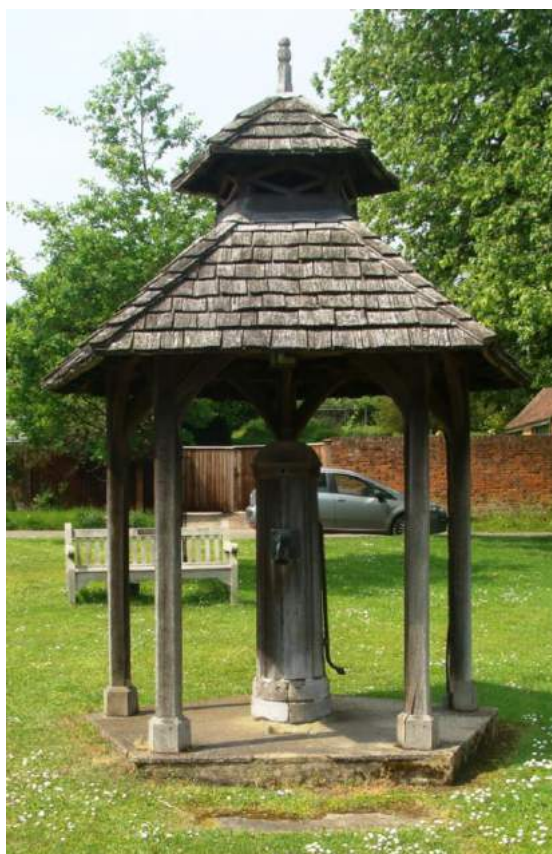
Picture 7. Picturesque Arts and Crafts style pump and canopy believed to date from about 1900.

5.17. Village Pump and Canopy - Grade II. Pump and canopy. About 1900, restored 1975. Cylindrical and domed oak to pump mechanism with fluted and spurred cast bronze spout enclosure and acorn finial. Oak hexagonal canopy on 6 posts with shingled roof in 2 stages with carved finial. Arts and Crafts Style carved decoration to tapering cylindrical casing with double chamfered base, vertical fluted and moulded sections, moulded capital and domed top carved with overlapping pointed leaves. Inscribed around capital 'TRAVERSE THE DESERT AND THEN YOU CAN TELL WHAT TREASURE EXISTS IN THE COOL DEEP WELL'. Oak posts with curved braces to wall plate and brackets supporting boarded soffit. Centre piece of picturesque village green.