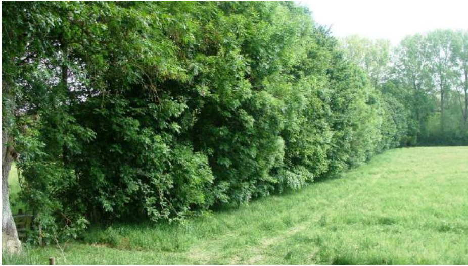
Picture 323. The strong field boundary that delineates open countryside from enclosed pasture and horse paddock land to the north.

5.589. The role trees play in defining the character of the conservation area and in framing and providing views of important historic buildings is demonstrated in the picture below.