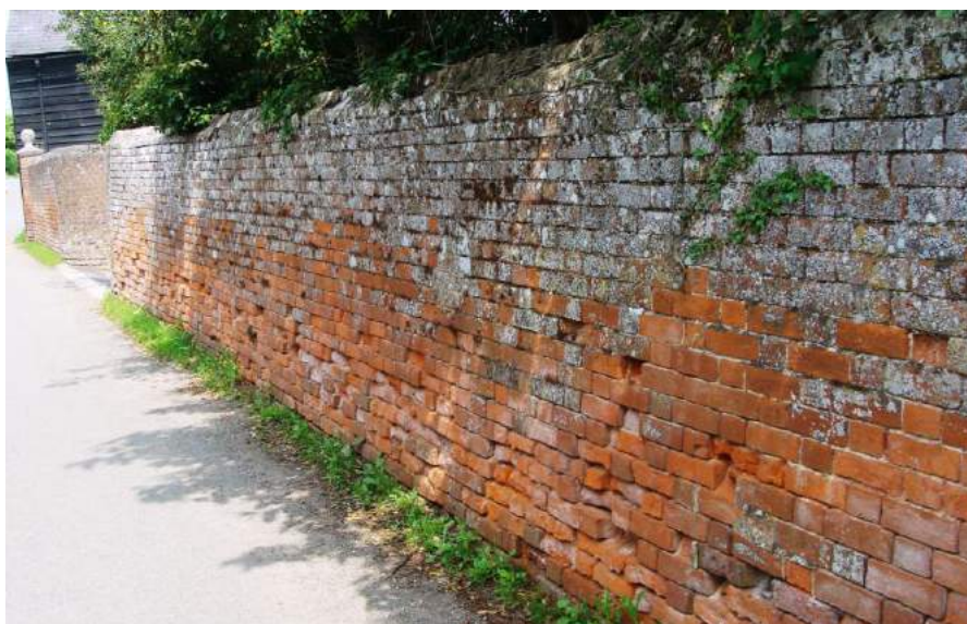
Picture 234. Frontage wall to Dial House. A prominent feature in a key location and in need of repair.

finial detailing. Some spalled brickwork in need of repair. The potential of grant assistance from EHDC exists.