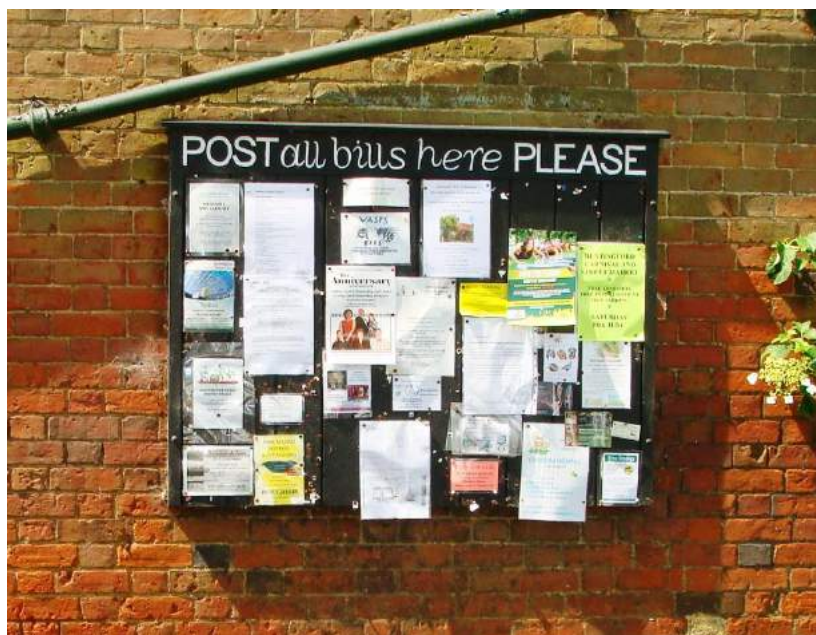
Picture 367. Is there a more acceptable solution (and or location) to disseminate community information?

5.623. Parish notice board. This clearly performs an important community function but nevertheless is untidy and visually detracts. Is there a more acceptable solution? Following consultation the PC have undertaken some improvements.